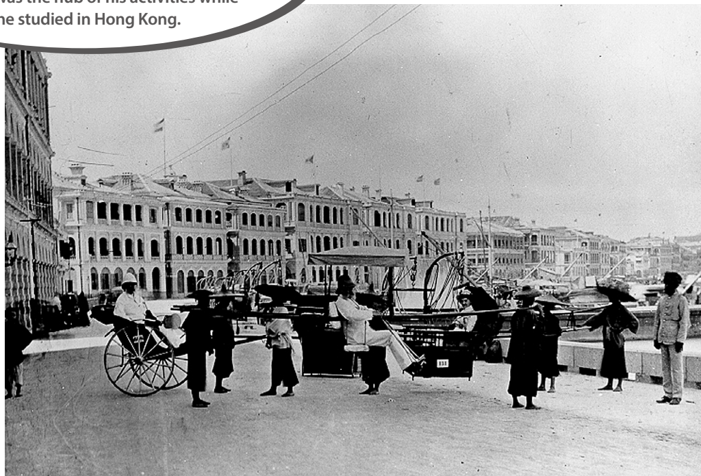
圖二：一八九零年代的中環沿岸 Fig. 2: Central harbourfront in the 1890s